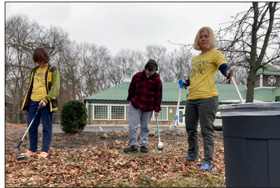
Ridge residents regularly volunteer to clean up litter throughout our community.

For years, Ridge Civic volunteers on our community cleanup committee have worked to help keep our streets clean. We're always looking for more likeminded friends to help us prevent more litter from the dirty birds. Come be a part of the solution at an upcoming meeting.